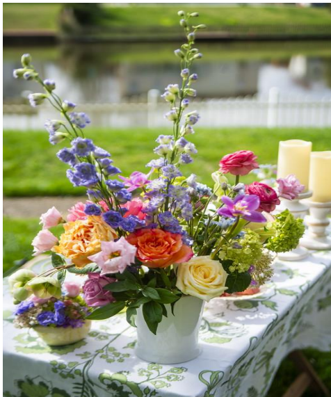
Can add on flowers

Whether you are a photographer and just want to have enjoy the gardens to yourself for sessions or are looking for a sweet private date night, this is for you! Rate is per hour and a half for private garden use.