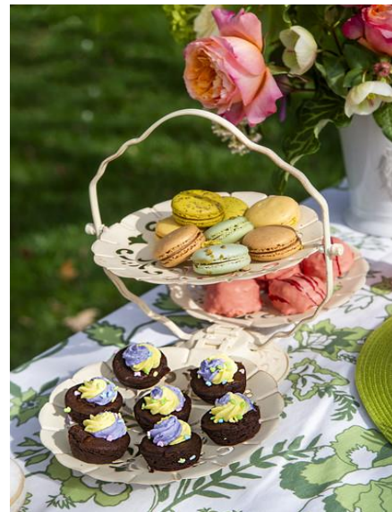
AND/OR Desserts or Charcuterie Board For additional fees